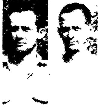
FUNK BROS. Washington Boro