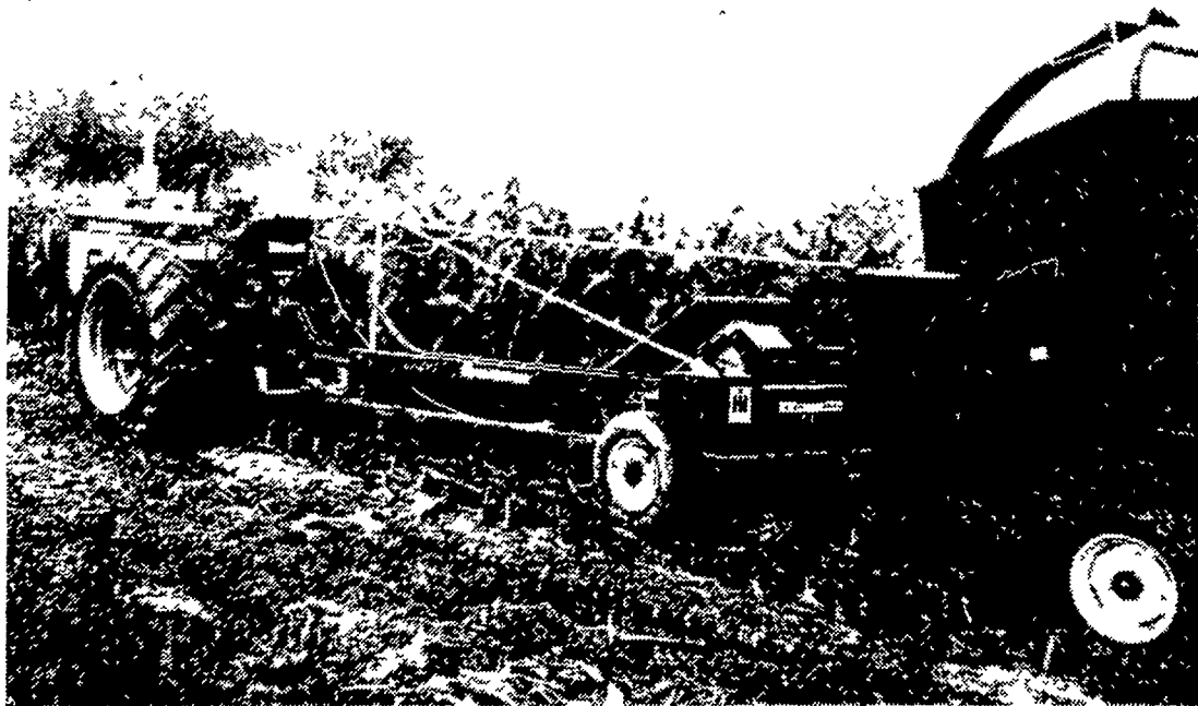
IHC "50" chopper wades easily through heavy corn at first National Grassland Field Days.

The No. 50 Chops Finer With Less Effort Also available—the one row No. 16 Field Harvester