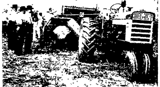
The IHC "50" chopper created a lot of interest among farmers who wanted to examine the fine-cutting knives.