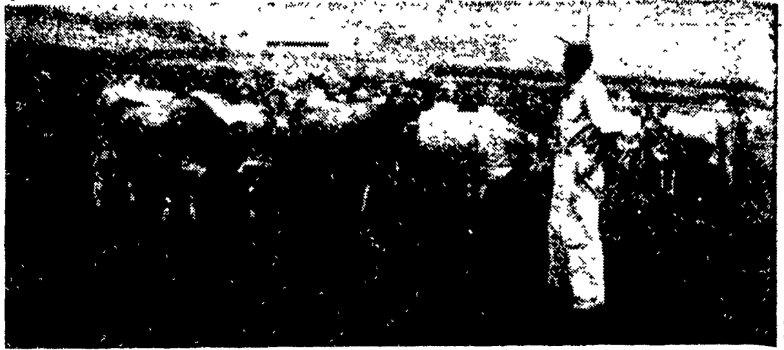
EDISON W. OSBORNE LOOKS OVER some of the 125 fine Jersey milk cows in his herd. He is counting on first calf heifers to bring the milking string up to 150 or 160 head this winter. Osborne is shooting for a 500 pound butterfat average this year. He has 460 pounds per cow now with two more testing periods to go in the D.H.I.A. testing year.

was still making good growth The 125 cows in the pasture on one side of the road and the 59 heifers in the pasture on the other side of the road appeared to be full and happy Even though the heifers in the maternity stalls were eating "forage extender" along with their hay, they were in excellent condition. While hay is shorter than