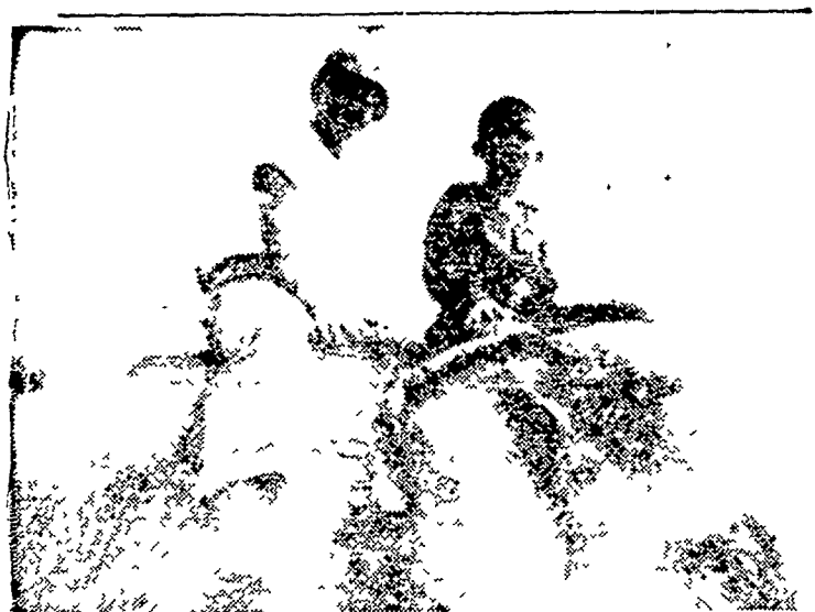
ON TOP OF OLD ... 4 U.S. G.I. and a young mahout take a ride on an elephant at Korat, Thailand. The unidentified soldier is part of the U.S. force sent to Thailand.