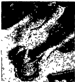
Knock out CRD with new Purina Tylan Soluble in chick drinking water.

When your chicks first arrive, add this powerful Health Aid to their drinking water. We can supply you with Purina Tylan Soluble in economical 100-gram or 2-gram packets.