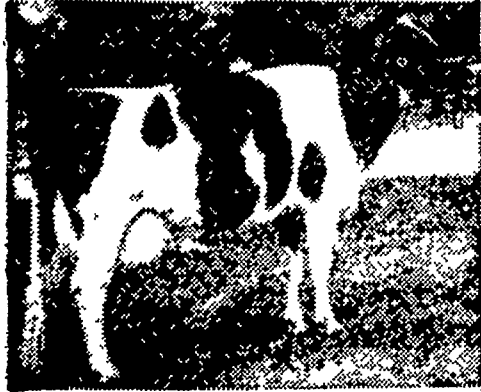
AFTER COMPLETING RECORD The same cow after having produced 23,044 lbs. of milk and 941 lbs. of fat as a 4 year old. Note the extreme dairyness and exceptional body condition shown after this cow produced 1 1/2 tons of milk!

600 pounds of PIONEER DRY and FRESHENING yields an extra TON OF MILK!