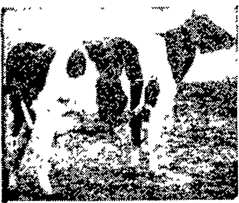
BEFORE CALVING This cow was fitted on the Pioneer program for 60 days before calving. Note the excellent "dry cow" body condition.