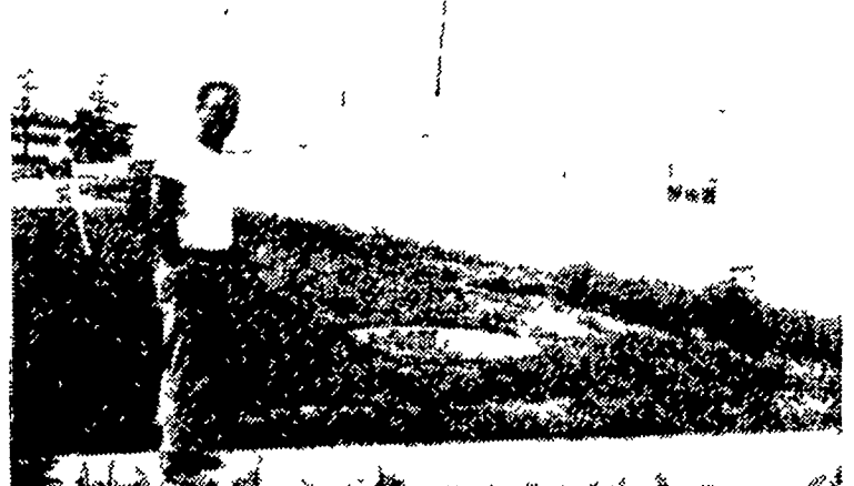
THE ONLY WINDOW in the farrowing house (extreme right) is in the service room where there is a desk for records and a cot for the attendant during farrowing season as well as medical supplies and equipment. In the farrowing house itself, the 24 farrowing crates are lighted by electricity and ventilation is taken care of by thermostatically controlled fans. In the far background can be seen the "nursery" where the sow is taken with her litter when the pigs are four weeks old. At six weeks the sow is taken from her pigs and the litter remains in the nursery until they are sold or put on feed in another building.

Hog Farm into a serum he called Porcina. Each pig gets an injection of drainings, and had the organ-ism cultured and processed the serum at two days of age