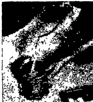
Knock out CRD with new Purina Tylan Soluble in chick drinking water.

When your chicks first arrive, add this powerful Health Aid to their drinking water. We can supply you with Purina Tylan Soluble in economical 100-gram or 2-gram packets.