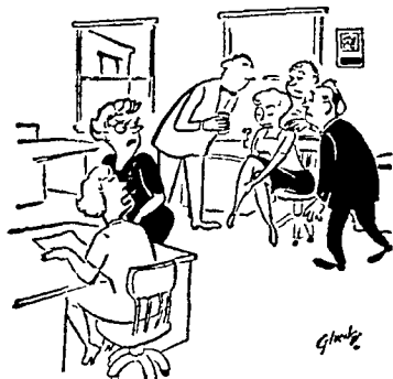
"All that fuss over a run in her stocking!"