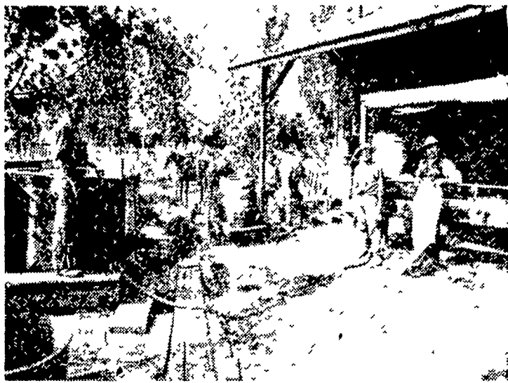
Milk followed a pretty unsanitary route from cow to consumer in turn of the century dairy plants—where methods and equipment were primitive in their simplicity.