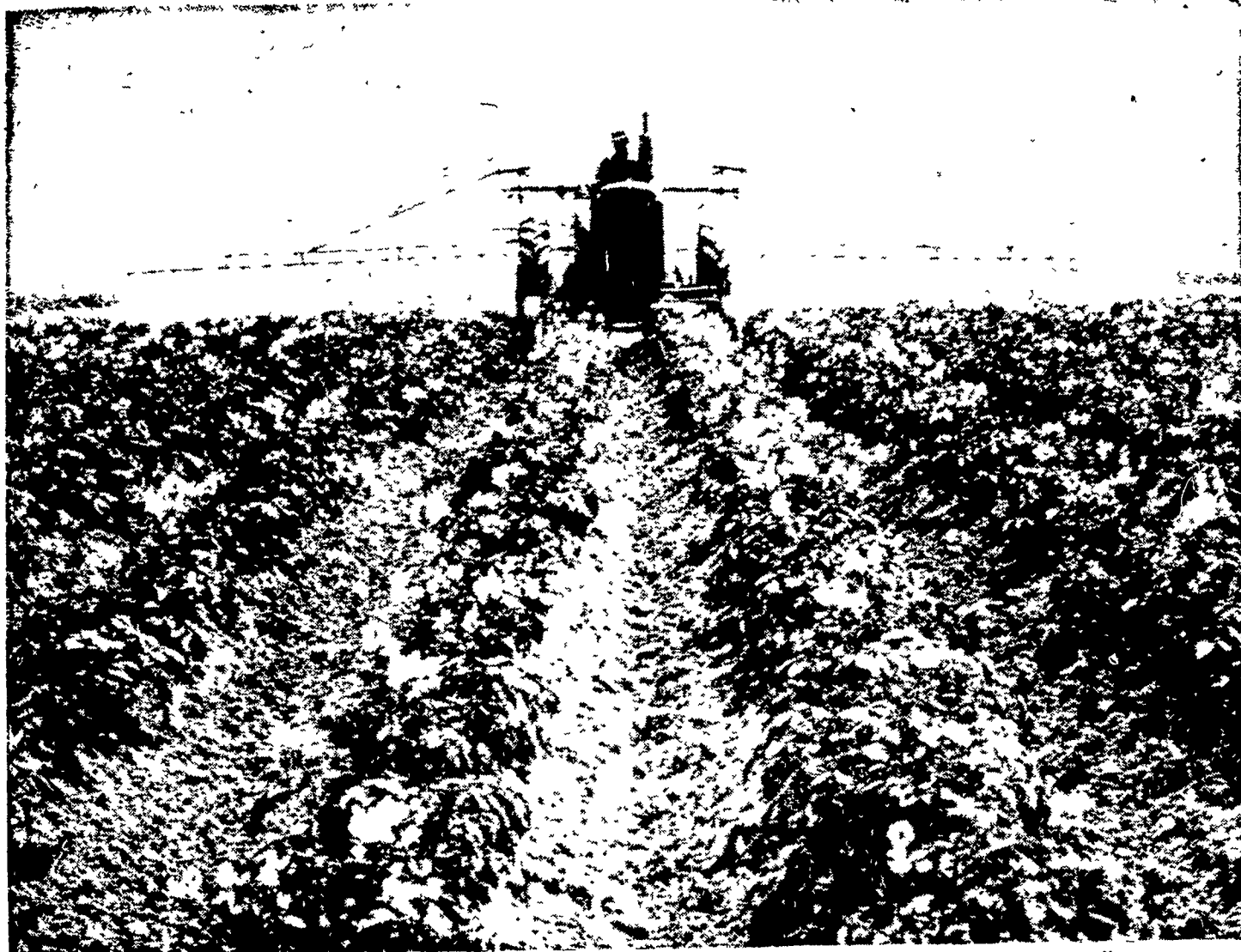
Tough on disease but mild on plants, "Manzate" gives your potatoes sure protection against early blight and late blight.

In other business, the members heard reports on the new chapter truck and the plans for the chapter's farming program.