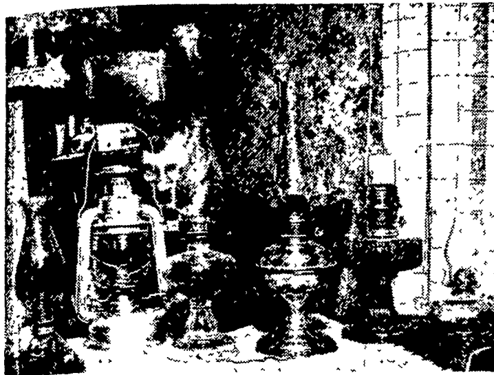
A frequent, always tiresome chore was cleaning the glass chimneys of coal-oil lamps, the only source of light in house and barn in the days before the lights came on electrically.