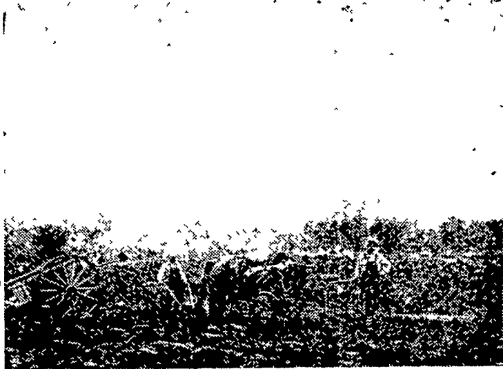
At the turn of the century many a farmer still used the same method of plowing as had his father and grandfather—a strong pair of oxen and a strong pair of arms.

Pruning should preserve the natural shape of the shrub. This is accomplished by cutting back some of the branches, removing dead, diseased, weak and broken branches, thinning