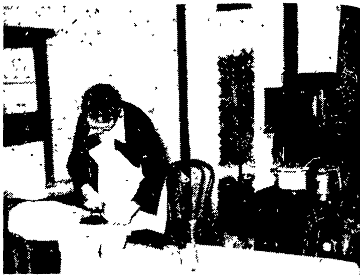
Before electricity came to the farm, a farmer's wife needed a strong arm, too—for lifting that heavy sadiron between wood range and ironing board several hundred times a week.