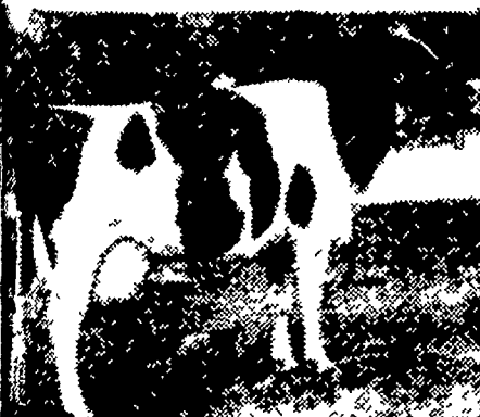
AFTER COMPLETING RECORD The same cow after having produced 23,044 lbs. of milk and 941 lbs. of fat as a 4 year old. Note the extreme dairyness and exceptional body condition shown after this cow produced 11 1/2 tons of milk!

600 pounds of PIONEER DRY and FRESHENING yields an extra TON OF MILK!