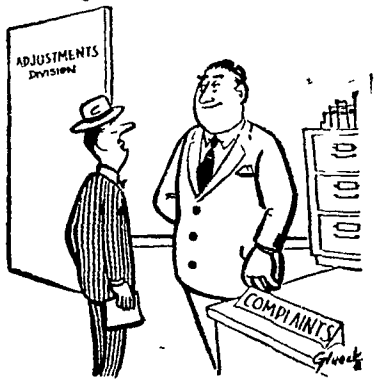
"Is there somebody more my size I can complain to?"