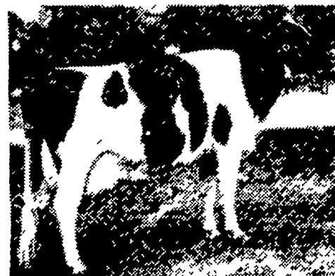
AFTER COMPLETING RECORD The same cow after having produced 23,044 lbs. of milk and 941 lbs. of fat as a 4 year old. Note the extreme dairyness and exceptional body condition shown after this cow produced 11 1/2 tons of milk!

600 pounds of PIONEER DRY and FRESHENING yields an extra TON OF MILK!