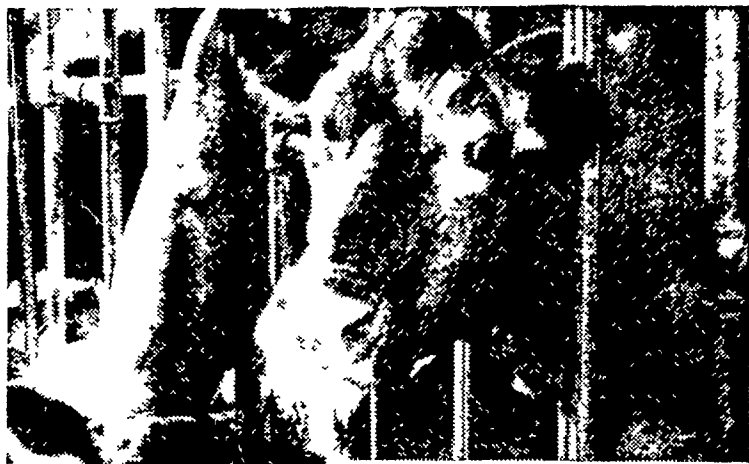
It's New from Wayne Research

32% DAIRY KRUMS plus your grain for Top Dairy Nutrition