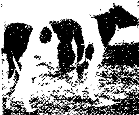
BEFORE CALVING This cow was fitted on the Pioneer program for 60 days before calving. Note the excellent "dry cow" body condition.

COWS PROPERLY CONDITIONED ... during the dry period PRODUCE UP TO 25% MORE MILK!