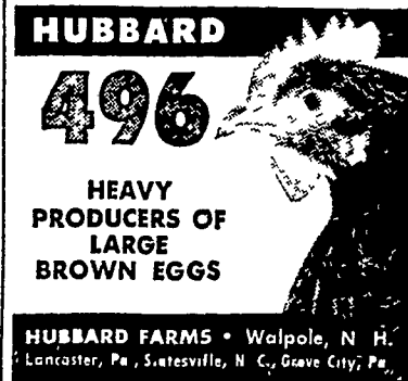
HUBBARD FARMS • Walpole, N. H. Lancaster, Pa., Statesville, N. C., Grove City, Pa.

Keystone Hatchery 2556 Creek Hill Rd. LANCASTER Ph. Leola OL 6-7851