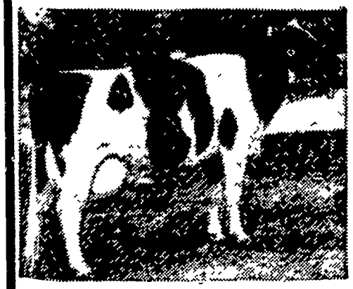
AFTER COMPLETING RECORD The same cow after having produced 23,044 lbs. of milk and 941 lbs. of fat as a 4 year old. Note the extreme dairyness and exceptional body condition shown after this cow produced 111/2 tons of milkl