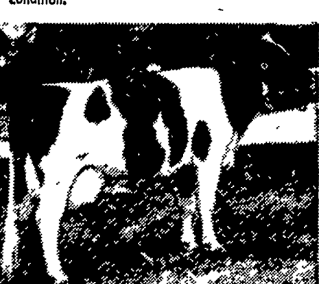
AFTER COMPLETING RECORD The same cow after having produced 23,044 lbs. of milk and 941 lbs. of fat as a 4 year old. Note the extreme dairyness and exceptional body condition shown after this cow produced 111/2 tons of milkl