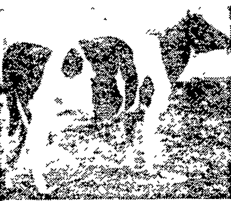
BEFORE CALVING This cow was fitted on the Pioneer program for 60 days before calving. Note the excellent "dry cow" body