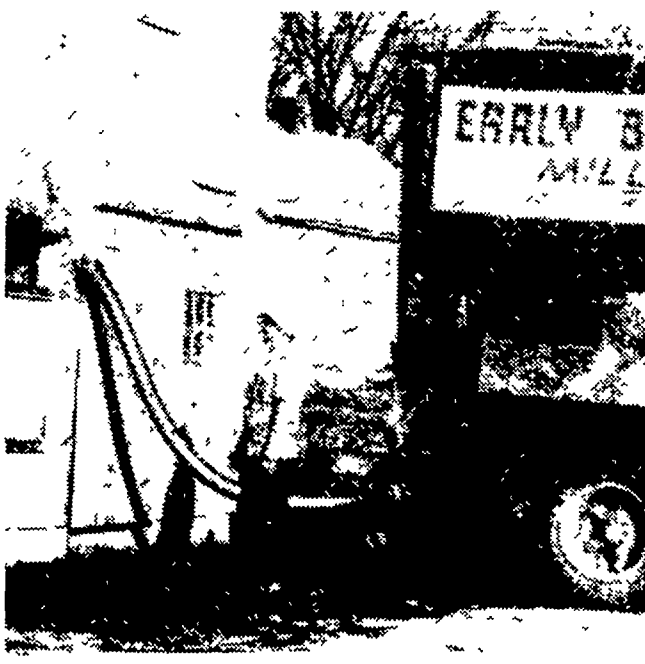
Saving time and money (on your farm).

May we help you do a more profitable job and lower your production costs? Contact any Miller & Bushong service representative or call us direct at Lancaster EXpress 2-2145