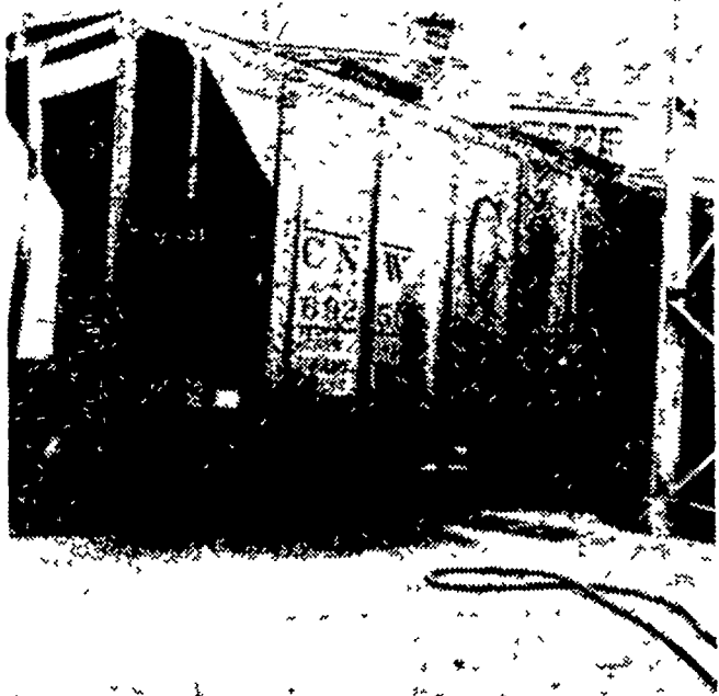
Bulk hopper car of soybean oil meal transfers its load into storage. Total ingredient capacity is 90 cars.

Results in lower production costs for you