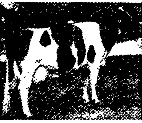
AFTER COMPLETING RECORD The same cow after having produced 23,044 lbs. of milk and 941 lbs. of fat as a 4 year old. Note the extreme dairyness and exceptional body condition shown after this cow produced 11½ tons of milk!

600 pounds of PIONEER DRY and FRESHENING yields an extra TON OF MILK!