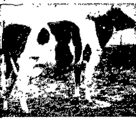
BEFORE CALVING This cow was fitted on the Pioneer program for 60 days before calving. Note the excellent "dry cow" body condition.