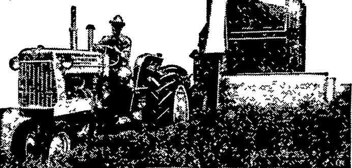
THE NEW ALLIS-CHALMERS 56-F FORAGE HARVESTER

the clean, fast cut you want for better feeding silage, easier handled