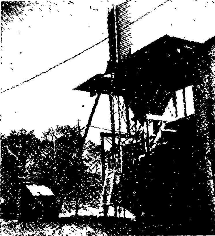
CORN ON THE J. ZEIGLER HESS FARM at Quarryville R3 is dried by forced hot air before being stored for the winter. After being dumped into the hopper, far left, by the truck, the shelled corn is augered up to the storage bin. It feeds by gravity into the batch drier where the moisture content is reduced to about 12 per cent. From the drier the grain goes to the storage bins in the foreground. Hess, on the platform above the drier, processed the corn about 50 acres of his own plus about 10,000 bushels for a cooperative last year. Hess believes much corn is going into storage too wet.