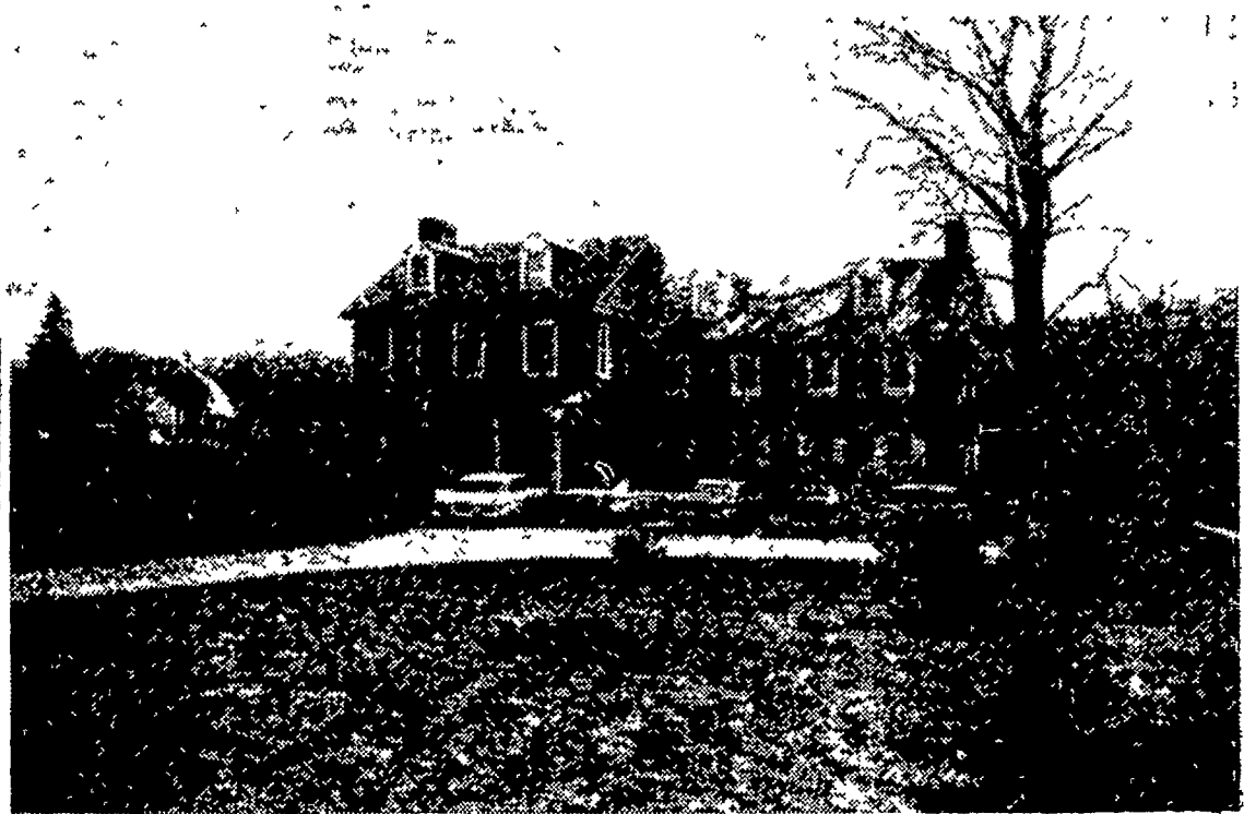
SPEEDWELL FORGE WILL BE THE SITE of the second annual Lancaster County Soil Conservation Field Day. This historic old farm is located on Hammer creek between the Lebanon pumping station and Elm. The house shown was the original ironmaster's mansion when Speedwell forge was in operation as the name implies. The present owner, Gerald Darlington, is replacing conservation practices on the land and some of the actual construction will be done during the field day, August 2.

During the speaking program scheduled to begin at 1:00 p.m. representatives of