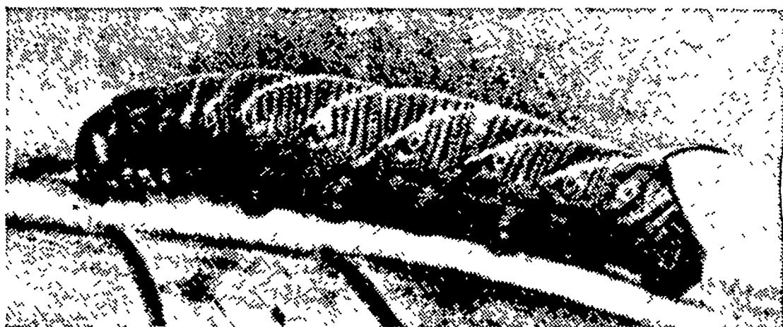
Tobacco hornworm — if not controlled, this pest can completely defoliate tobacco plants.