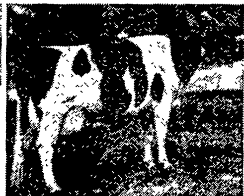
AFTER COMPLETING RECORD The same cow after having produced 23,044 lbs. of milk and 943 lbs. of fat up to 4 year old. Note the extreme dairyness and exceptional body condition shown after this cow produced 11 1/2 tons of milk.

60 DAYS ON PIONEER DRY AND FRESHENING WILL IMPROVE PROFITABILITY OF YOUR HERD