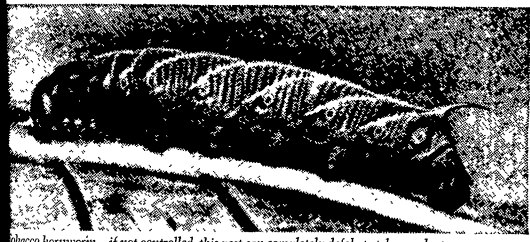
tobacco hornworm—if not controlled, this pest can completely defoliate tobacco plants.