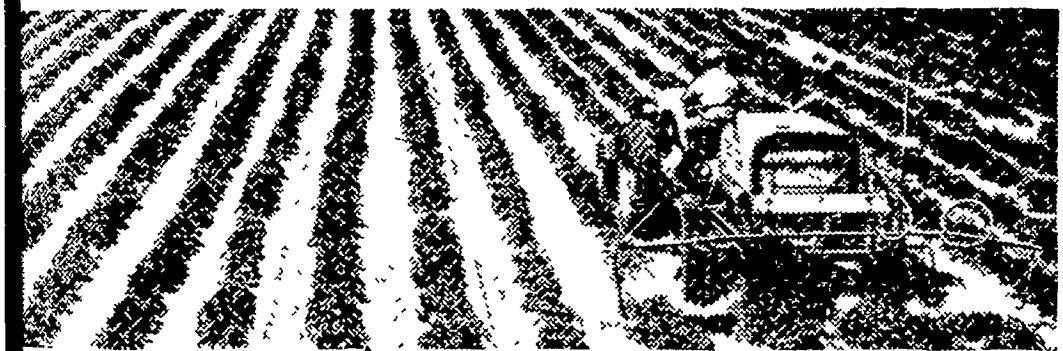
Dieldrin sprays are economical and long-lasting. They control major potato insects.