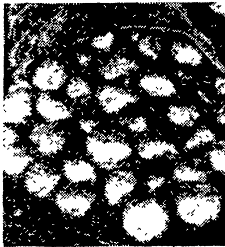
Each acre you spray with "Manzate" can yield bushels more of #1's like these. Field applications of "Manzate" protect your crops from late blight tuber rot, too.

One-chemical blight control —a spray program with "Manzate" maneb fungicide controls both early and late blights.