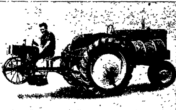
SEE THE GENUINE