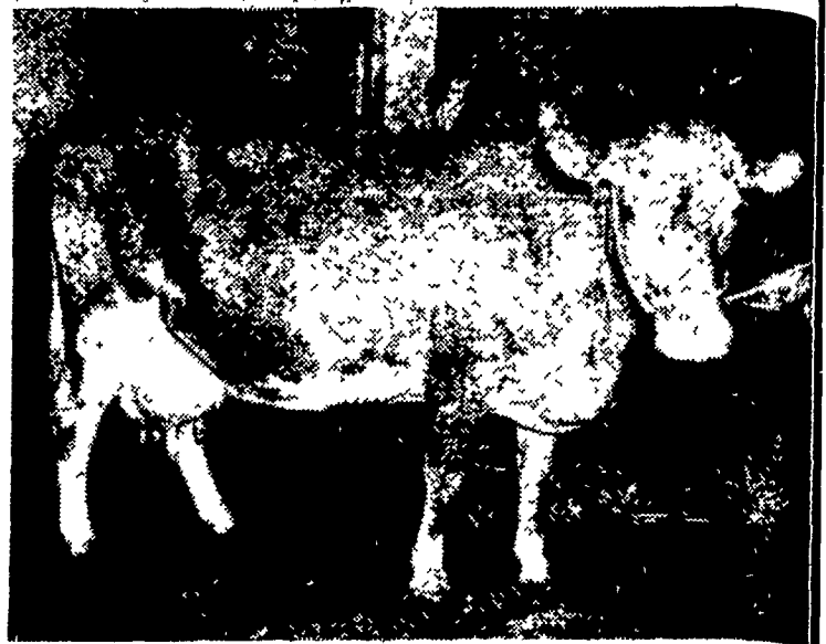
AS A FIVE YEAR OLD, this cow, Maple Springs Mable has produced 4,672 pounds of milk and 243 of fat in the first 80 days of her lactation. She has three previous records of 462, 617 and 562 pounds of butterfat. Even with seven first-calf heifers among the 11 mature cows, the Breckbill herd averaged 53 pounds of butterfat per cow during March.

The barn is not modern by the standards many dairymen would use, but there is a contentment among the cows. An occasional sign above the drone of the evidence that this herd was healthy and happy.