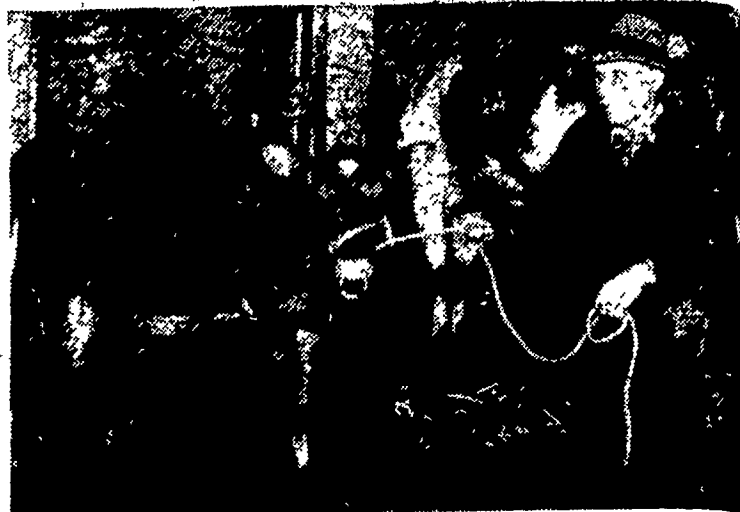
GROWTHY CALVES WITH BIG MIDDLES like this daughter of McDonald PreNugget out of Maple Springs Vernice grow into the kind of heifers that can use large amounts of forage and small amounts of expensive grain. The Dam of the calf pictured produced one 305 day record of 13 397 pounds of milk and 615 pounds of fat. The sire is in the stud at the Southeastern Penna. Artificial Breeders' Cooperative.

The present owner of Maple Springs began farming there about 42 years ago. Many things change, he said as he exhibited the bulk tank in the milk house. "I thought I was pretty old to put the bulk tank in," he said, "But a neighbor said 'I am still a young man, but (Turn to page 8)