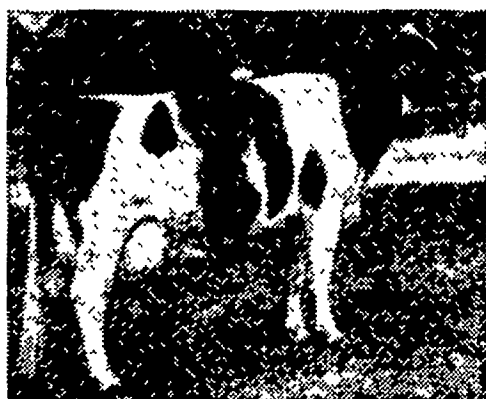
AFTER COMPLETING RECORD The same cow after having produced 23,044 lbs. of milk and 941 lbs. of fat as a 4 year old. Note the extreme dairy-ness and exceptional body condition shown after this cow produced 11 1/2 tons of milk.