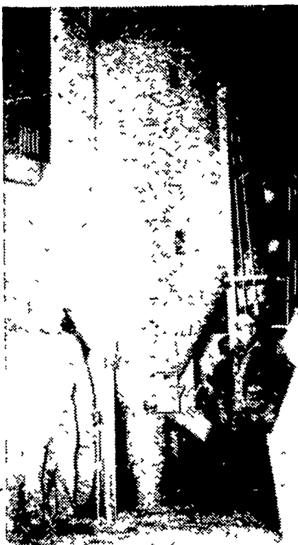
Ellis Jones, left, and Samuel Kinsey beam with pride as they stand beside our New 5-TON VERTICAL MIXER - BLENDER. This modern Mixer - Blender, two 2-ton Vertical Mixers and two Hammer-mills combine to offer greatly improved service and increased capacity.