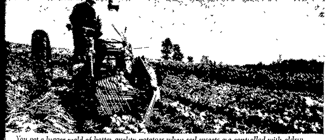
You get a bigger yield of better quality potatoes when soil insects are controlled with aldrin.

2. Feed the new Wirthmore Complete Growing Ration the entire growing period. (Or Wirthmore Grow and Egg and grains)