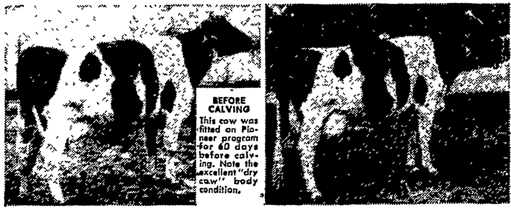
BEFORE CALVING This cow was fitted on Pioneer program for 60 days before calving. Note the excellent "dry cow" body condition.