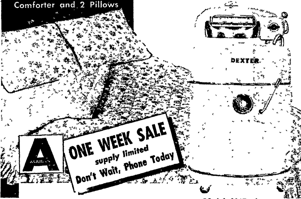
Model 904P shown

This big, "light as thistledown" comforter and pillows are washable, odorless, mothproof, non-allergenic, and forever fluffy, because they are filled 100% with the wonderful new virgin ACRYLAN "down." The Nylon-stitched French-crepe covering is lovely to the eye and the touch, and stays that way. Comforter 72" x 84". Two pillows each 18" x 24". Each in own storage bag. "Warmth without weight" for luxurious rest.