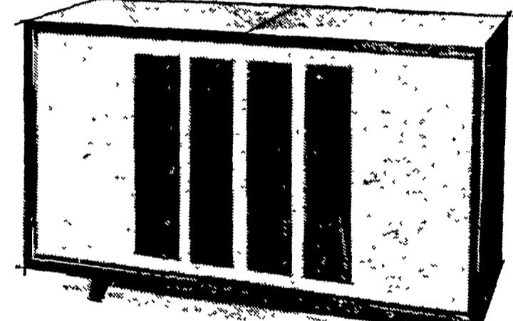
BELL TEMPO: Striking modern styling in natural oiled walnut.