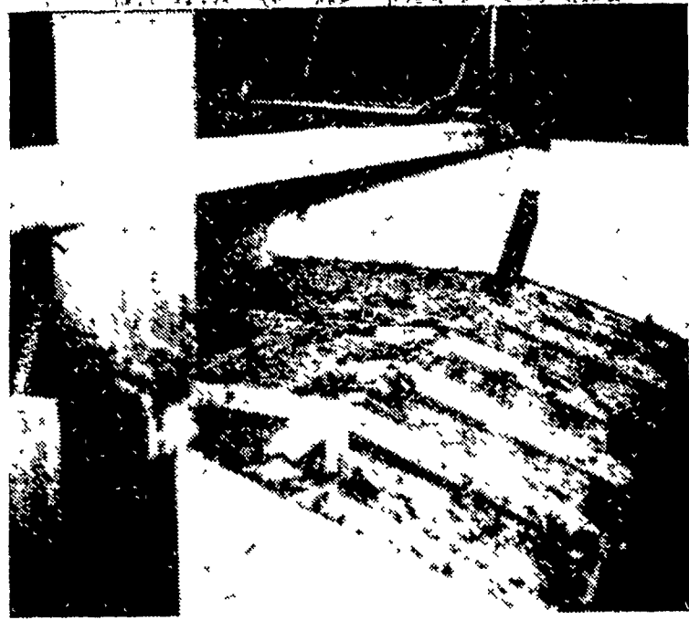
A DUCT OF WIRE OVER A FRAMEWORK of wood forms the bottom of the bin where the tobacco is kept during the browning stage. Air is forced through the tobacco to prevent heating or sweating. During the time the tobacco is changing from the yellow color to brown, it must be stirred or turned several times to keep it from packing or caking. The turning is done with a pitch fork and is an easy task according to the workers who have done it.