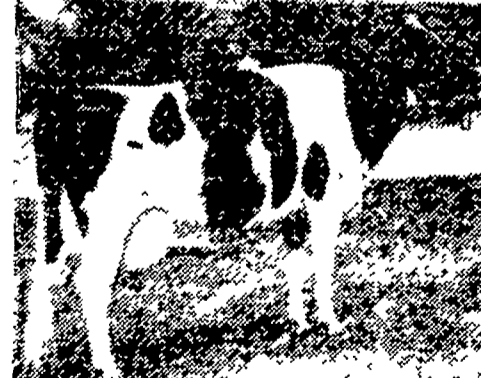
AFTER COMPLETING RECORD The same cow after having produced 23,044 lbs of milk and 941 lbs. of fat as a 4 year old. Note the extreme dairyness and exceptional body condition shown after this cow produced 11 1/2 tons of milk!

600 pounds of PIONEER DRY and FRESHENING yields an extra TON OF MILK!