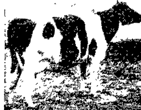
BEFORE CALVING This cow was fitted on the Pioneer program for 60 days before calving. Note the excellent "dry cow" body condition.