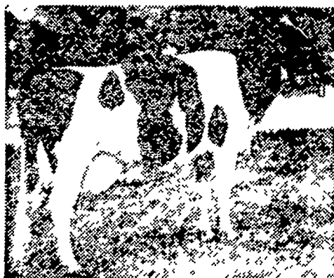
AFTER COMPLETING RECORD The same cow after having produced 23,044 lbs. of milk and 941 lbs of fat as a 4 year old. Note the extreme dairyness and exceptional body condition shown after this cow produced 11½ tons of milk!

600 pounds of PIONEER DRY and FRESHENING yields an extra TON OF MILK!