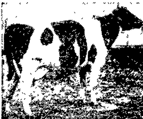
BEFORE CALVING This cow was fitted on the Pioneer program for 60 days before calving. Note the excellent "dry cow" body condition.

COWS PROPERLY CONDITIONED ... during the dry period PRODUCE UP TO 25% MORE MILK!