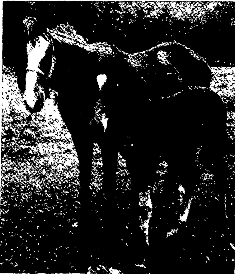
GINGER AND HER FILLY wonder what the man with the black box it up to. The filly, one of the first foals sired by Shining Sunday, breaks naturally into the walking horse gait whenever she moves out of a walk. Walking horses on Shady Brook Farm have access to good pasture, shade and water during the summer and box stalls during winter months