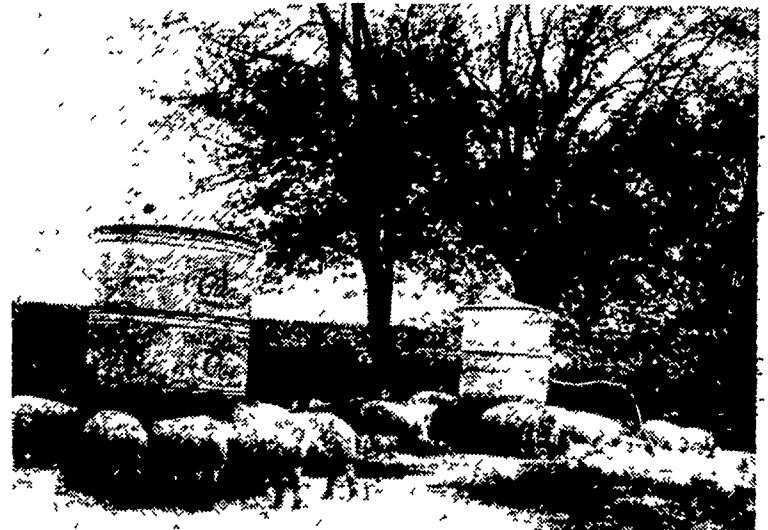
FEED, WATER AND SHADE in abundance add up to the right combination to turn pigs like these into the top quality hogs demanded by the butcher and the American housewife. The hogs in this feed lot will be topped out each week as they reach market weight. Contracts with local butchers will take the bulk of the fat hogs. Surplus will be marketed through Stockyard channels.

of them on terraces green men with the help and en- with barley ready to come couragement of their father into full head, give evidence have built up the soil on of the increasing fertility of their two farms while pro- the farm. Next week, Lan- ducing large acreages o f- caster Farming will attempt canning crops and grains to show how these 2 young each year.