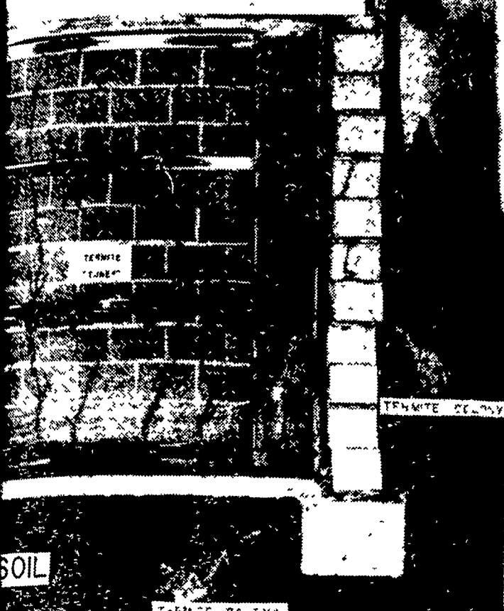
ONE OF THE SIGNS TO LOOK FOR if you suspect termite infection is the presence of the termite tubes running up over masonry walls to the wooden beams above. Since the workers must return to the soil each day for moisture, they build these little earthen tunnels to protect their delicate bodies from exposure to direct light or dry atmosphere. Termite colonies remain active most of the year, but swarm only in the spring when the temperature goes above 70 degrees.

It is the consensus of most persons contacted who have had experience with termite infestations, that the job of controlling them is a job for experts or professionals. The average property owner should be able to recognize the signs of infestation, but the task of control is too complex for the experiences and equipment of the average layman.