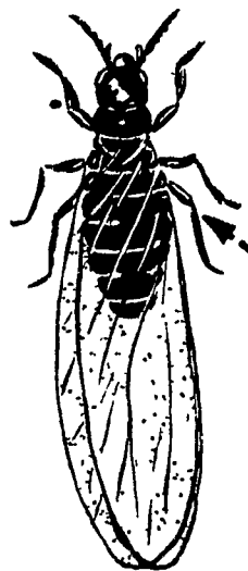
WITH THE Flying Ant