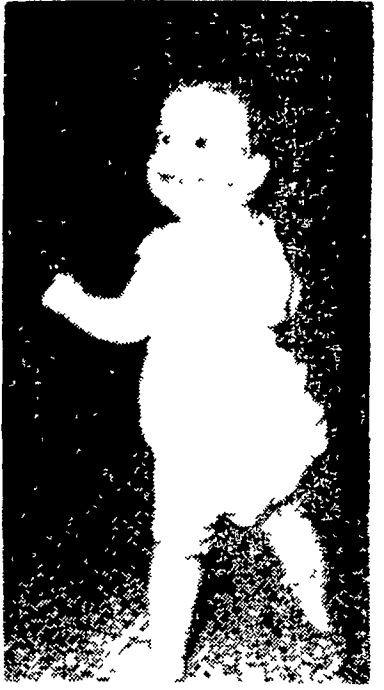
"DID YOU SAY KEYSTONE LEGHORNS."