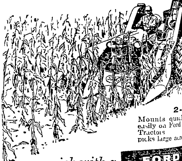
2- Mounts quickly easily on Ford Tractors picks large acre