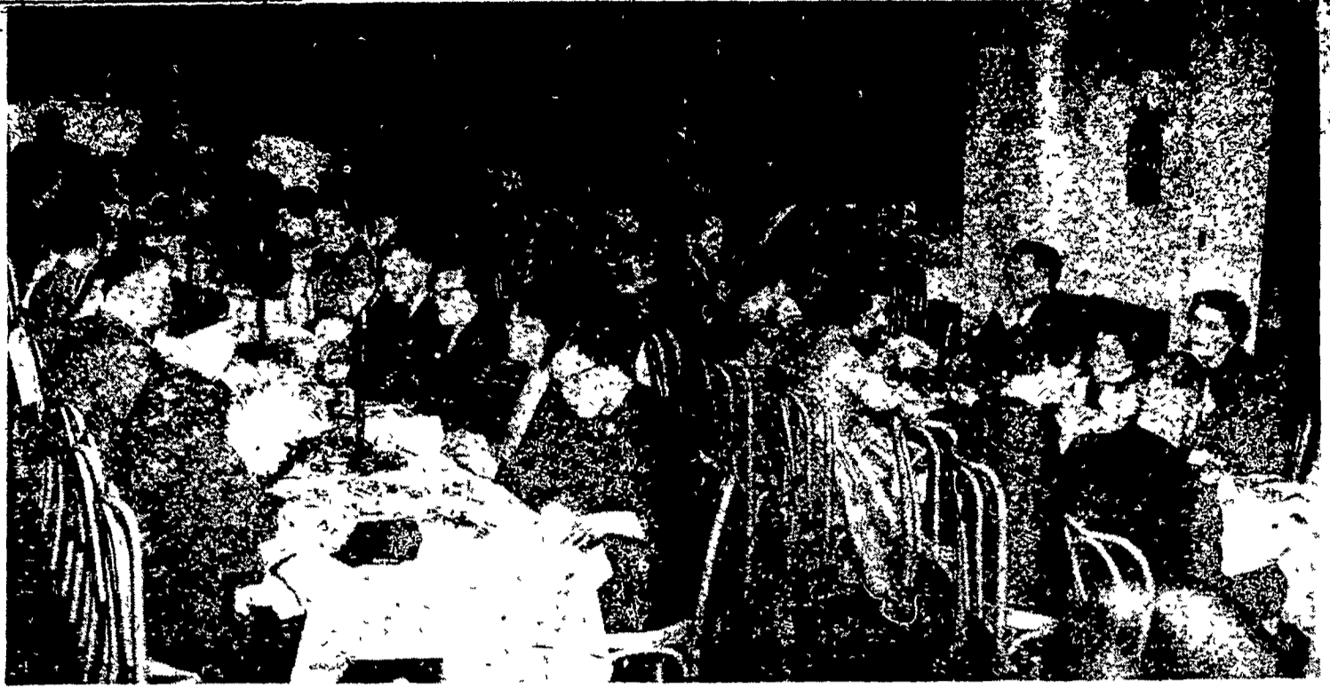
MEMBERS OF SOCIETY 15 gathered Thursday evening in Quarryville's Spanish Tavern for their annual Christmas Banquet. Here the Society is shown at the repast, with families and guests. On this week's Women's Page, are several recipes for holiday treats prepared by some of the group's members.

During the Growers' business meeting, committees were established to manage the 1959 Fruit Growers' Queen contest, the annual banquet in early January and to arrange the county fruit exhibit at the 1959