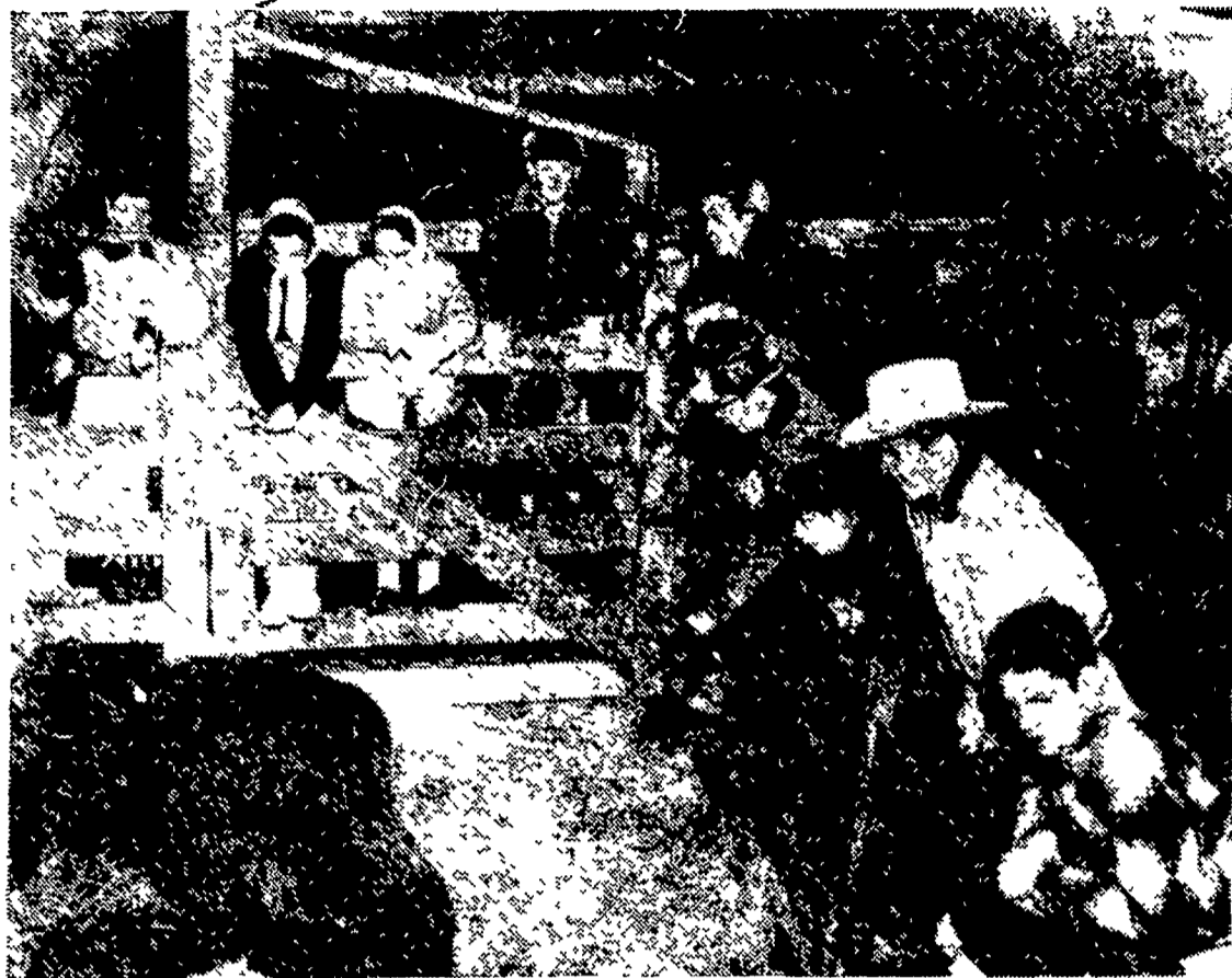
WITH THE drawing for club calves just completed, members of New Holland 4-H Baby Beef club hurried to the pens Wednesday evening to examine the animals they will pet, pamper and fatten during the next ten months. Eighteen club members drew lots for 10 angus and eight hereford steers, with each youngster, " . . . getting the best one."