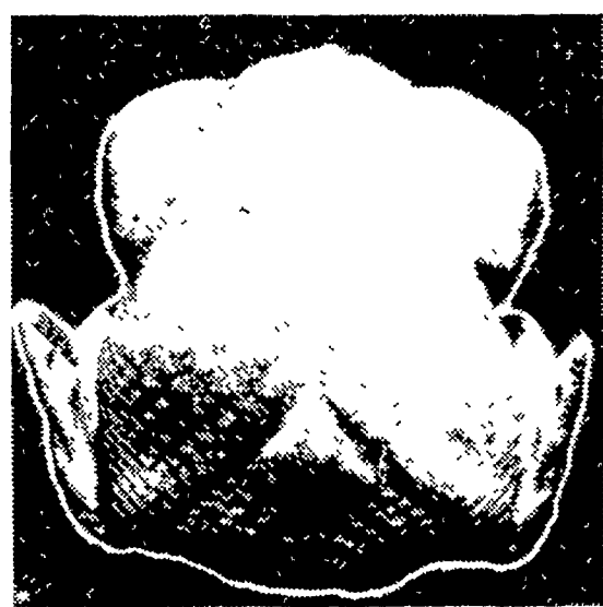
↓ Typical of the fine market finish of ESBENSHADE'S turkeys is the dressed bird shown below.