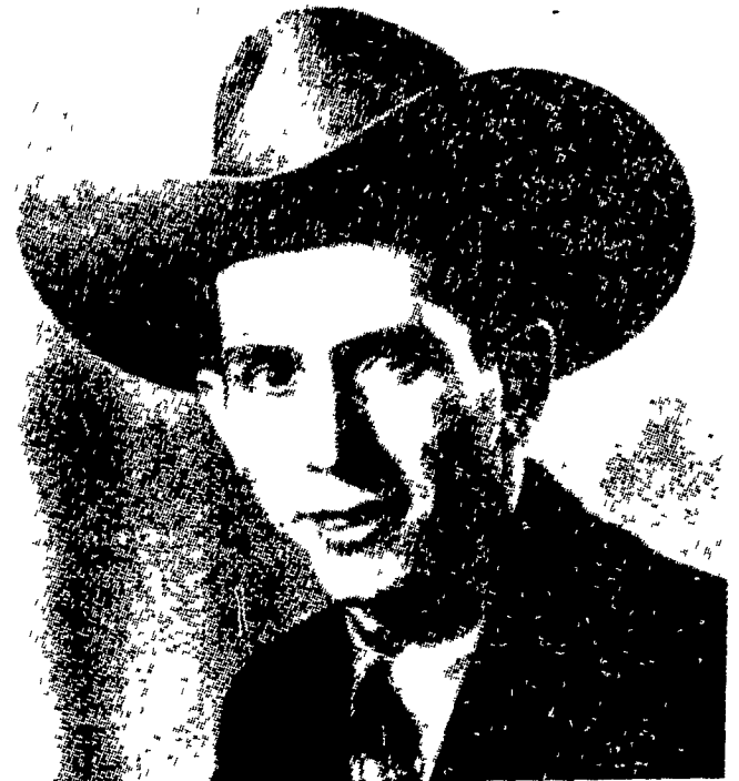
JIM SHOULDERS, holder of 18 World's Championships in professional rodeo, three All-Around titles, winner of more than $300,000 and a solid "dirt" rancher. The No. 1 cowboy of rodeo history.